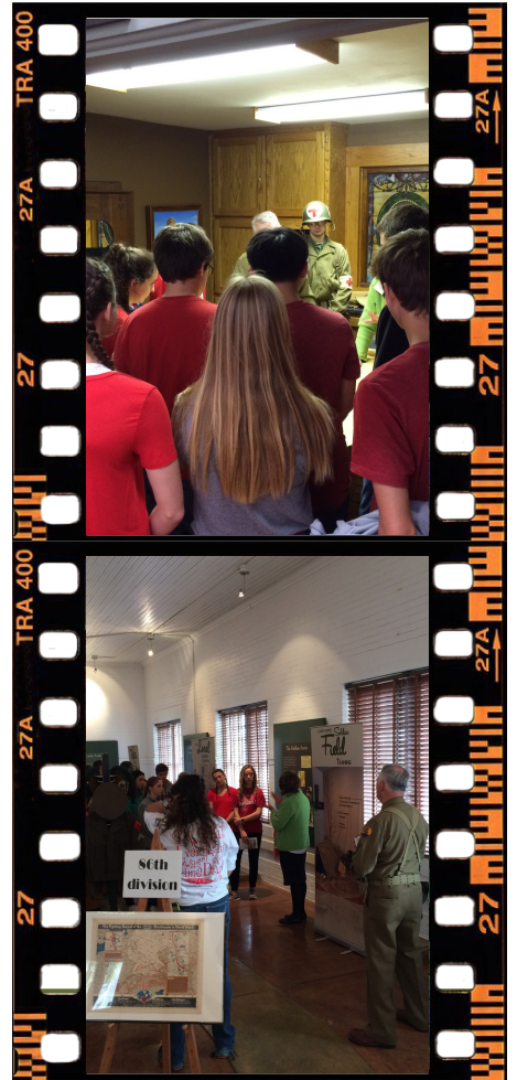
Hosting School from Oklahoma at Morton Museum / Depot

During the Covid years we provided ZOOM interactions with school systems during their WWII lesson plans and aided the teacher in covering relevant topics to enhance learning.